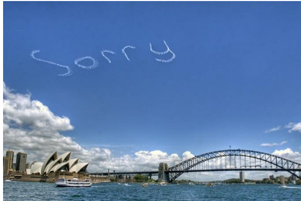
Sydney on Australia Day 2008, three weeks prior to the Apology. The 'Sorry' writing was commissioned by a private individual.

With secondary students, explore the excellent National Museum Australia site Collaborating for Indigenous Rights and teaching resources and work through the activities with your students.