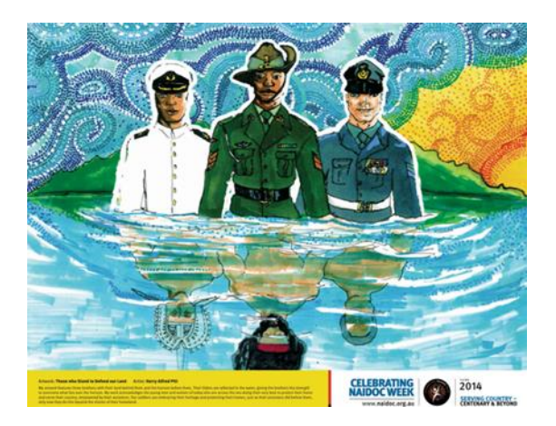
NAIDOC 2014 poster see <u>http://www.naidoc.org.au/poster-gallery</u>

Schools and individuals might be interested in attending the annual <u>Victorian Aboriginal</u> <u>Remembrance Service</u> held at the Shrine of Remembrance on the 31 <sup>st</sup> May, from 11am-2 pm , with the laying of a wreath on the forecourt.