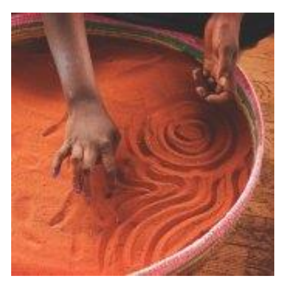
Symbols in the sand.

We strongly recommend that as educators in early education settings and schools you include Aboriginal Arts content, commencing with local Aboriginal perspectives, following the model above. By exploring Victorian art forms such as cross hatching, line drawing and wood-burning, the use of textiles and design in the production of possum skin cloaks, tools, weapons and jewellery etc., and elements of history and identity expressed through art and design. BY exploring the works and lives of Victorian artists past and present and inviting Victorian artists to support your program.