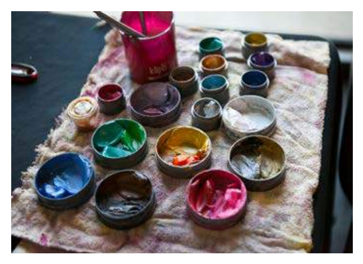
Paints for contributing to a collective artwork at a commemorative event - creative and visual arts are a great way to engage students and community members

• Set up a Wonder Wall - a wall space that promotes inquiry into a topic where students can display their 'wonderings' or questions. This could be made using several large pieces of paper of different colours with room for students to attach their responses. For example, you might write 'Today we remembered the Apology that was made to Australia's Indigenous Peoples, and what this meant to the Stolen Generations. I wonder...'