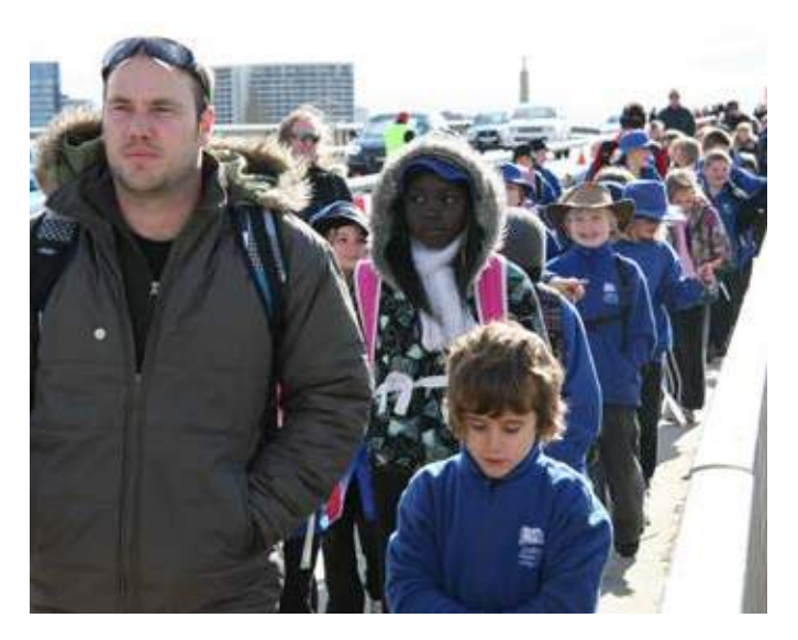
Local schools participating in a community bridge walk in Canberra

As with creating a successful event for National Sorry Day, it is important to involve the community in planning for this event. As the Apology Anniversary falls so soon after the start of the new school year, try to start planning and preparing for your Apology Anniversary celebrations towards the end of the previous calendar year (around November and December).