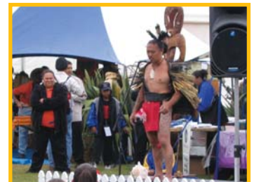
Showcasing Maori culture, WIPCE:2005

In conjunction with the schools unit, we have been working with the Department of Education and Training on the revamping of the Koorie Strategy Plan . This will be an important development in the provision of services for Koorie students in the schooling sector. More information on this project will be available in the new year.