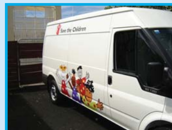
The mobile playbus at the launch held at the Maribyrnong Gathering Place

On 24 October, a Mobile Playgroup session was launched at the Gathering Place, Maribyrnong and at the end of November in Collingwood for the flats residents. 16-20 children, with their parents/carers are currently attending the Monday session in Maribyrnong and 8-10 children with their parents/carers the Thursday