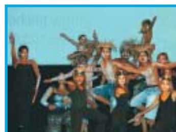
Wolithita Dance Group