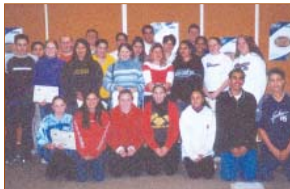
Alfred Felton Bequest

The Unit was also involved, in conjunction with KEST and the Education Foundation, in the organization of the ‘Alfred Felton Bequest Scholarship Recipients Two Day Mentor Residential’ held in Melbourne on the 14th & 15th August. Of the 48 Scholarship Recipients 29 students attended from all over the state along with 11 KEDO’s, 9 LAECG Representatives and 3 Koorie Educators. The main objectives of this inaugural event was to bring together recipients to focus on local and regional support mechanisms, the concept of ‘Mentor’, role models (including former scholarship recipients sharing their experiences), student aspirations and continuing success within the education system. Feedback from participants included a need for more role models sharing their educational experiences, with most approving the local and regional focus. We are currently working towards a program for next year. Thanks to all of those involved, especially the students who attended this successful event.