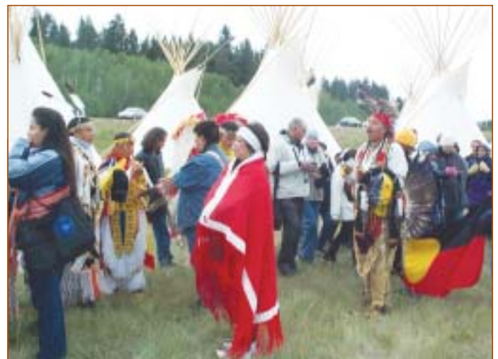
Parade of Nations at WIPCE