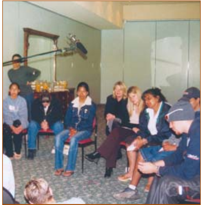
Participants at Youth Forum - Bendigo