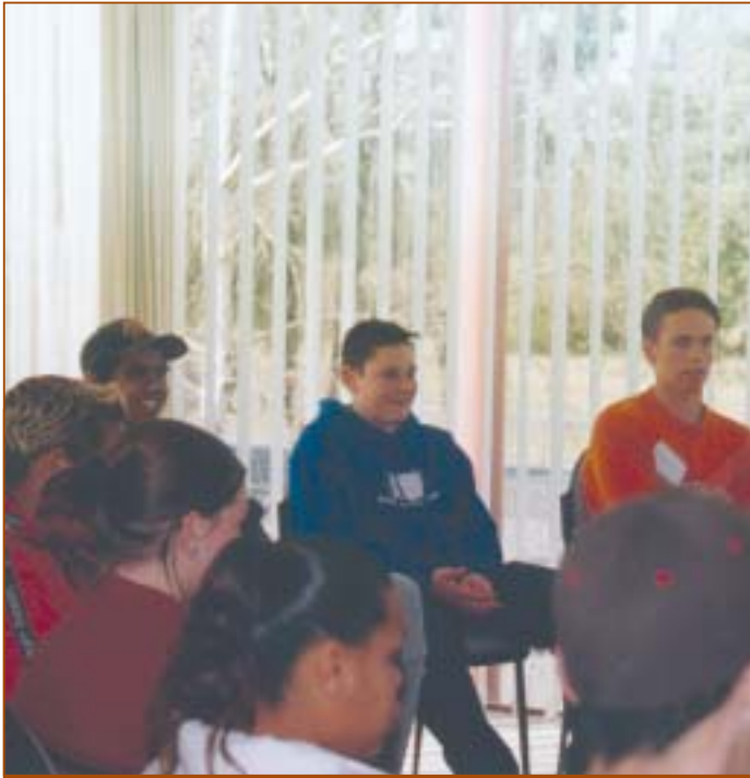
Participants at Youth Forum - Morwell