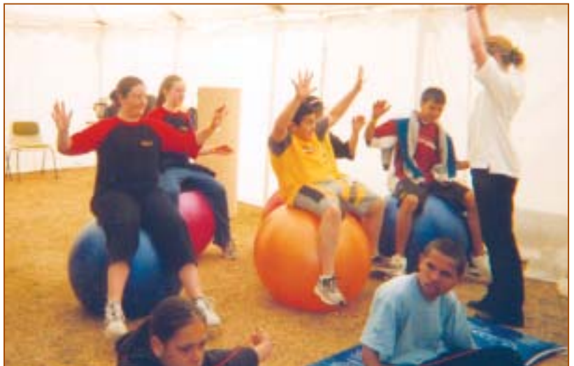
VAEAI Kids at Croc Festival activities

More than 1500 primary and secondary students aged between 9 and 18 years performed on stage and more than 3000 attendees were part of the audience.