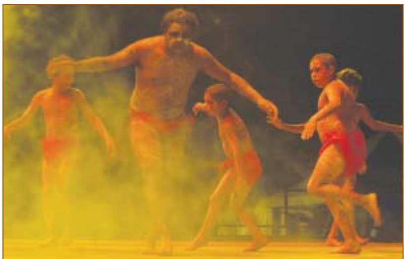
Morwell KODE (Performances)