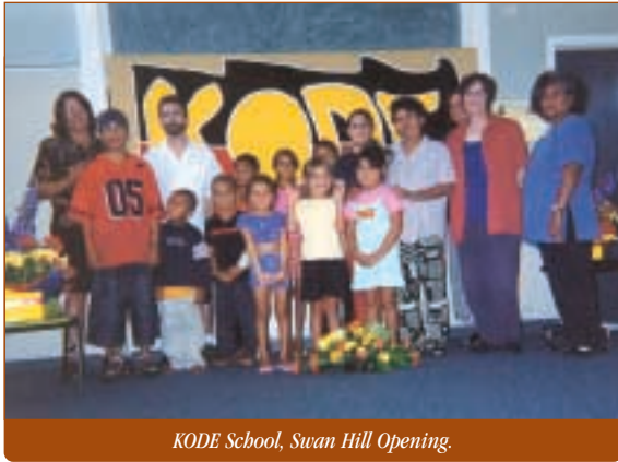
KODE School, Swan Hill Opening.