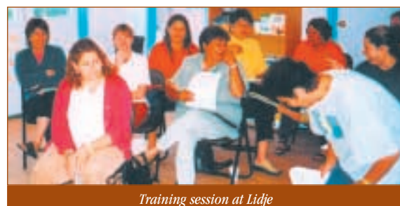
Training session at Lidje

VAEAI facilitated 2 series of training sessions for the MACS. They were delivered by the University of Ballarat and attended by MACS staff. It was also a great opportunity for Gunai Lidje and Bung Yarnnda staff to meet and visit each other's centre, as it was Lidje, Berrimba and Robinvale staff to meet at Lidje and Berrimba.