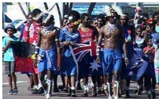
Mabo Day Celebrations in Townsville, QLD 2011 see: http://www.abc.net.au/local/videos/2011/06/03/3235188.htm

Background information about the landmark Yorta Yorta case can be found on the SLV site here . More comprehensive information about the Yorta Yorta Struggle for Land Justice can be found on the On Country Learning Course Wordpress site.